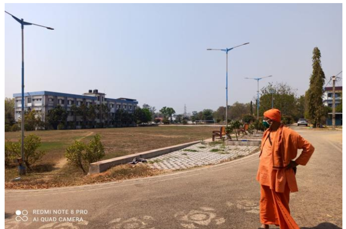
Eklavya School Jhargram Campus_3