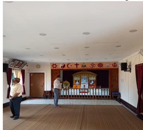
Inside RK Mission Jhargram Prayer Hall