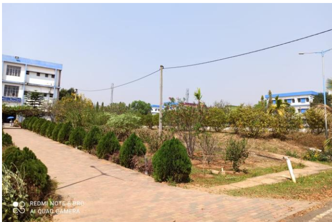
Eklavya School Jhargram Campus_2