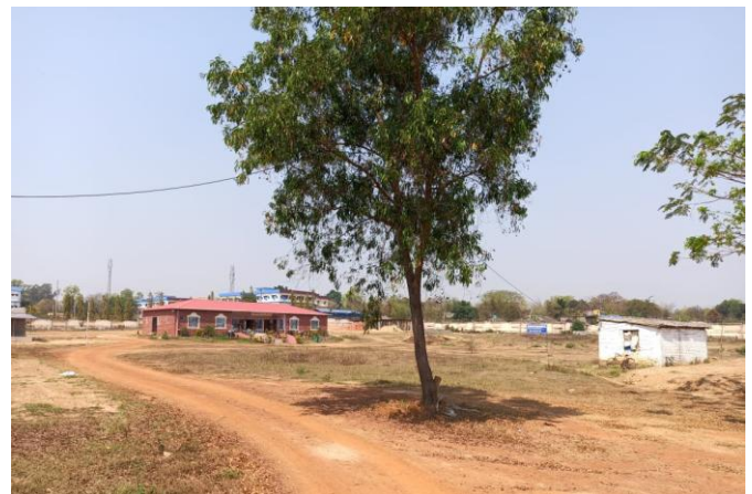
Under construction RK Mission Jhargram Campus