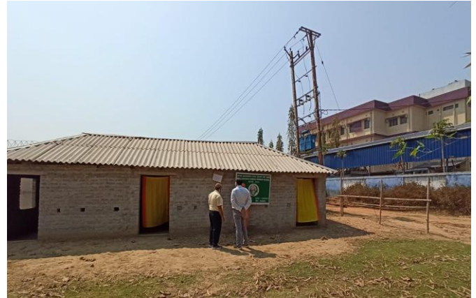
Study Centre near Eklavya School Jhargram Campus