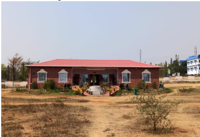
Prayer Hall RK Mission Jhargram Campus