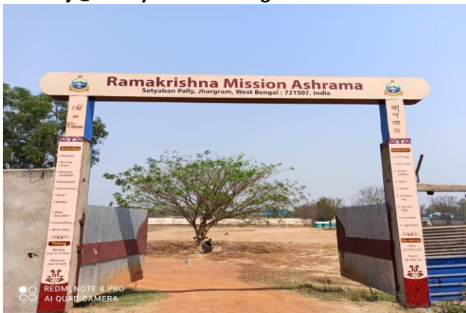
RK Mission Jhargram