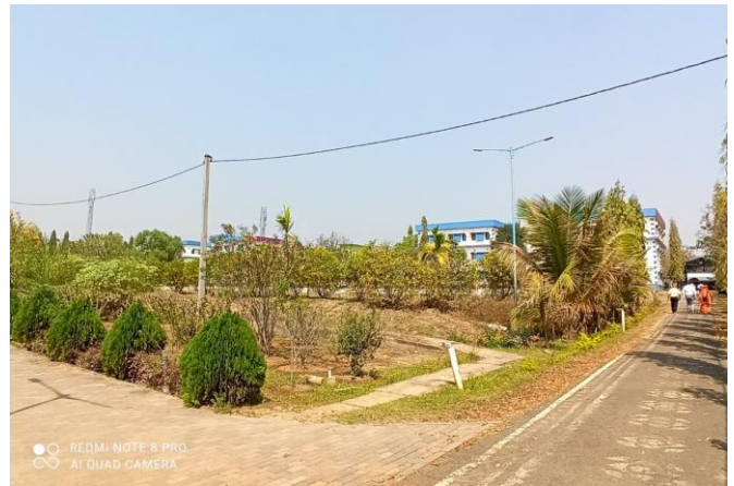
Eklavya School Jhargram Campus_1